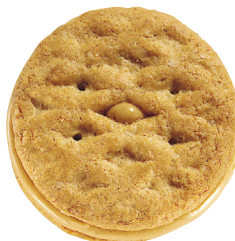
Peanut Butter Sandwich

Crispy vanilla cookie layered with peanut butter with a chocolatey coating.