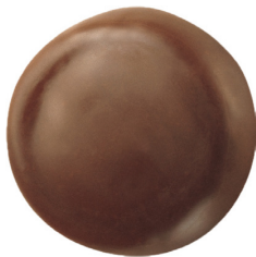
Peanut Butter Patties®

All varieties of Girl Scout Cookies (except gluten-free) are sold at $6 a package. Visit www.abcbakers.com to learn more