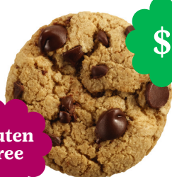
Caramel Chocolate Chip

Traditional favorite with a light, buttery flavor.